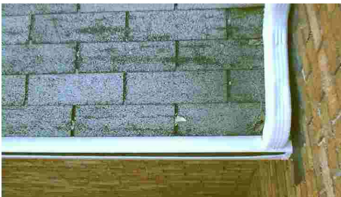
The left photo shows a properly installed leader and gutter system. The gutter is a "leaf proof" design, and downspout from the upper roof is piped directly into the lower roof's gutter.