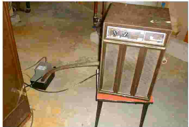
A good humidifier, elevated with an automatic discharge can make a dramatic difference in keeping a basement dry.

On the left is a water storage tank that evidences mold growth. Additionally, in very humid conditions, large amounts of water can drip off the outer walls of the tank and become a source of moisture for mold growth in other areas of the basement.