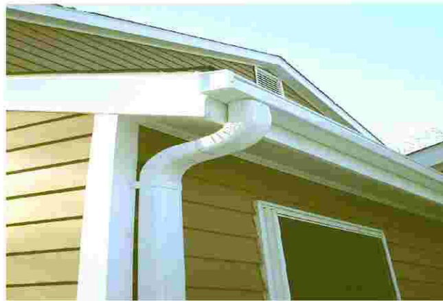
Having properly installed and clean gutters is an important element to controlling water

Correcting leaking gutters and roofs, discharge of water from leaders at the foundation, windows, walls, drains, foundation leaks, sweating or leaking pipes, poor grading around the house or any other source of