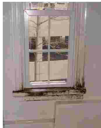
Typical bath room window with mold

Biologically derived contaminants spores are present in the air we breathe and are on surfaces in our environment. In order to grow, they wait for perfect conditions of high humidity (moisture) appropriate temperatures, and food. Food sources consist of substances such as dust, wood, ceiling tiles, drywalls insulation, carpets and paper products. When the spores meet with a sources of moisture such as