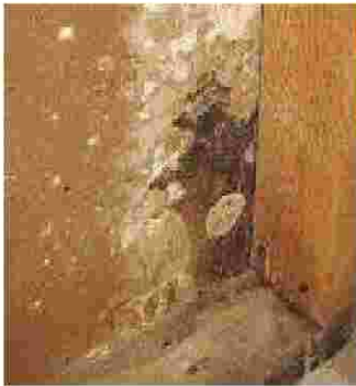
Mold growing on a closet wall.

Biologically derived contaminants have been around forever. In fact archeologists have found, and scientists have identified fossilized mold spores from the days of the dinosaurs. There are even references in the Bible to mold.