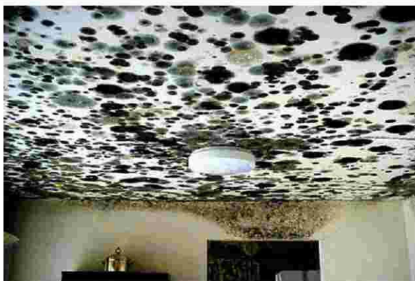
Ceiling infiltrated with microbial contamination